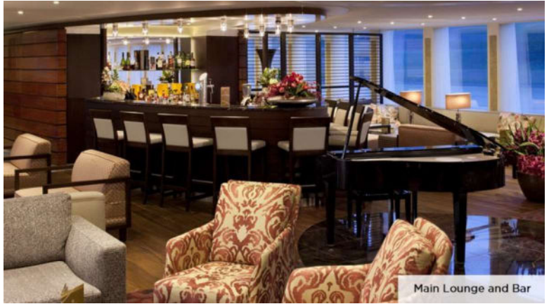
Main Lounge and Bar