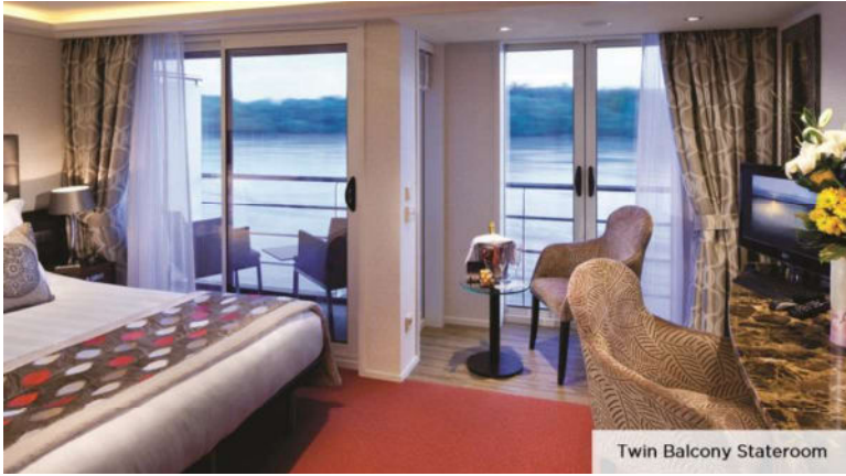
Twin Balcony Stateroom

7-night cruise | August 27-September 3, 2025 | Aboard AmaCerto