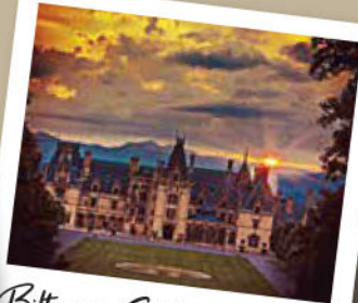
Biltmore Estates in Asheville