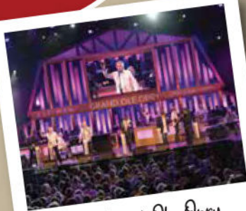
The Grand Ole Opry