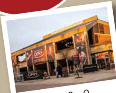
Grand Ole Opry