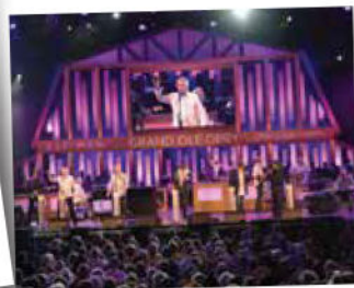
The Shows Were Great...