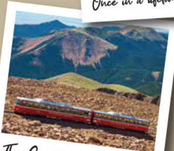
The Country is Beautiful!

10 | 9 | 10 Days | Nights | Meals All Transportation