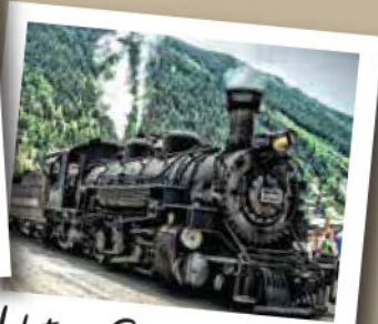
Historic Steam Engine...