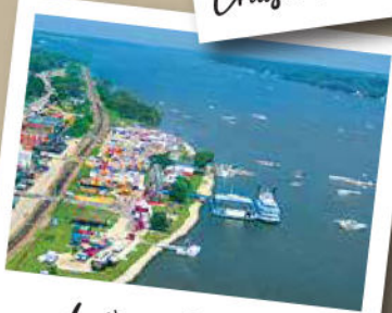
Lot's of Shopping