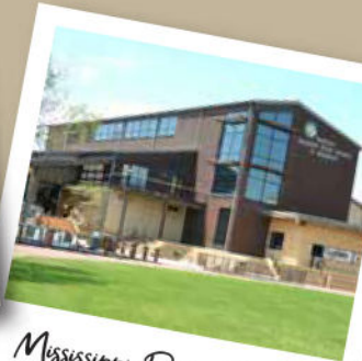
Mississippi River Museum