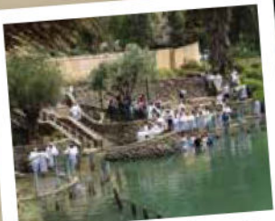
Baptisms at Yardenit