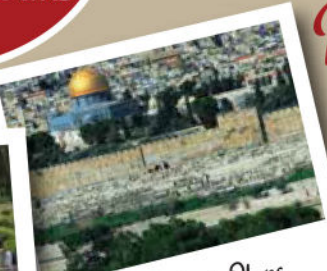
Mount of Olives