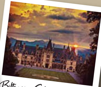
Biltmore Estates in Asheville