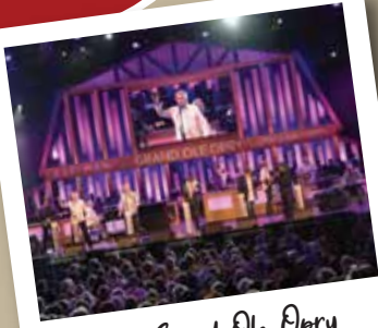
The Grand Ole Opry