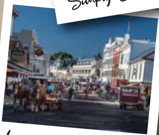
Loved our carriage driver!

10 | 9 | 10 Days | Nights | Meals All Transportation